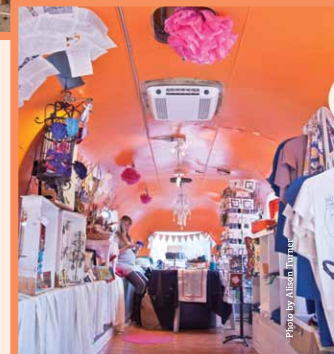
ABOVE: The Gowalla Airstream is all about making connections, between people, events, and places — and apparently, crazed encounters in trailers. OPPOSITE PAGE: Stella the Wondercraft is a boutique-on-wheels for four different businesses.