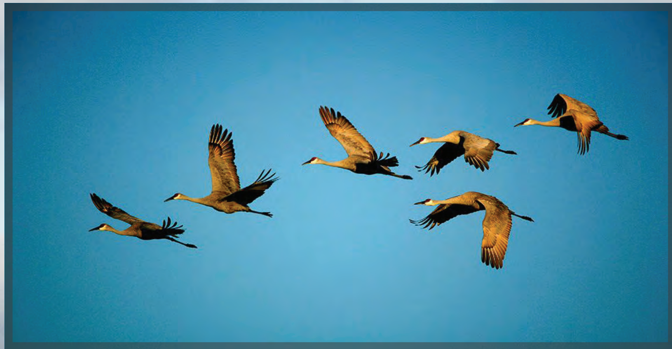
INSET: Sandhill cranes in dramatic flight in Titusville, Florida. BELOW: A farmer's pond near Cazenovia, New York, that is often visited by thousands of wildfowl.