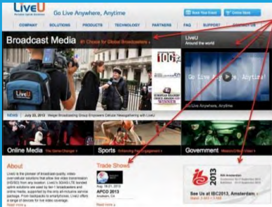
LiveU's homepage when viewed by prospects from the broadcast media industry