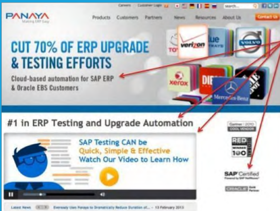
Panaya targeting the SAP market